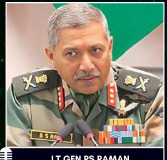
LT GEN RS RAMAN