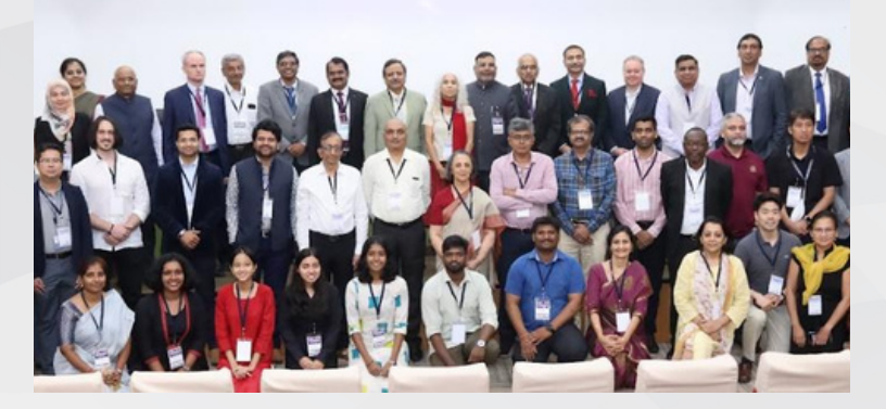
ISpA-Blue Origin Workshop 2022