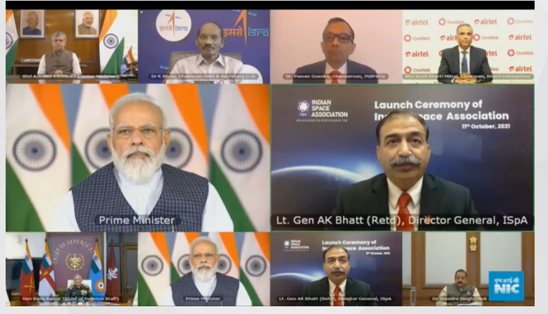
ISpA Launch Ceremony: 11th Oct 2021